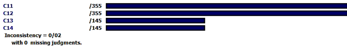
Fig.2. Weights of the wind farm task assessment criteria (Calculated in Expert Choice Software)

Afterwards, for each task, the appropriate training courses have been obtained. In addition, for each course, the average of the related job assessment indicators has been calculated. These are shown in Table 5.